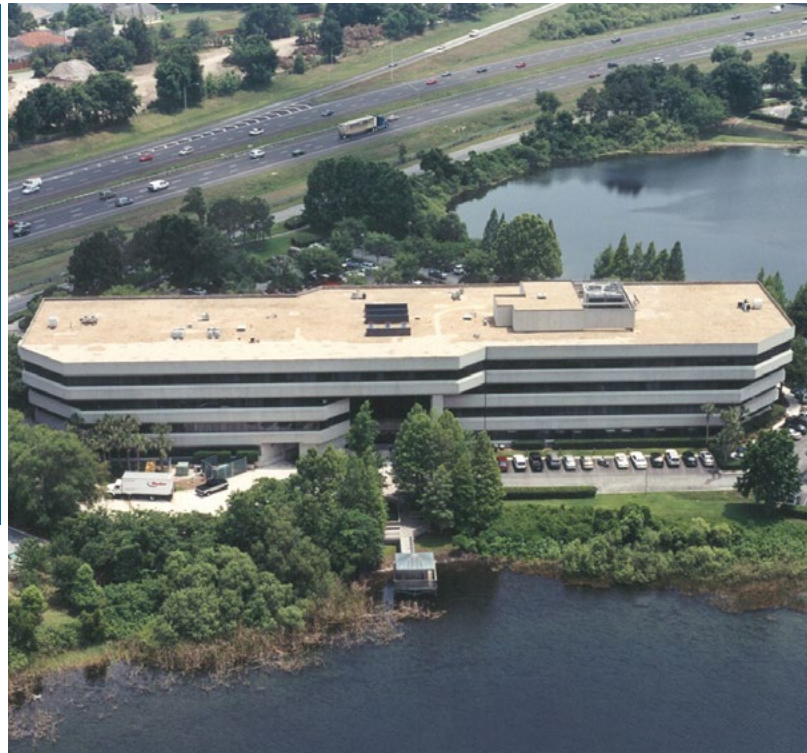
High visibility from I-4, interstate pylon signage available