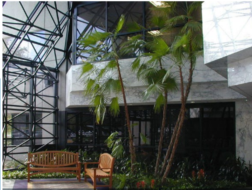
Large atrium with skylights, interior fountains, and marble finishes